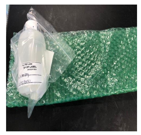
Figure 6 - Bubble wrapping of sample pack

3. Bubble wrap may be used to help keep the sample upright during shipment, preventing possible leakage (see Figure 6).