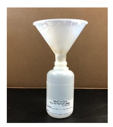
Figure 2 - Bottle filled with the aid of a funnel

6. Place sampling bottle cap back onto bottle and firmly hand tighten cap closed.