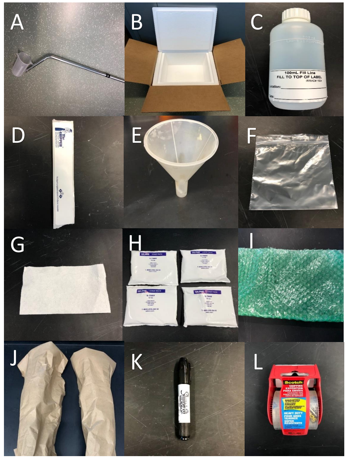
Figure 1 – Examples of sampling and shipping materials