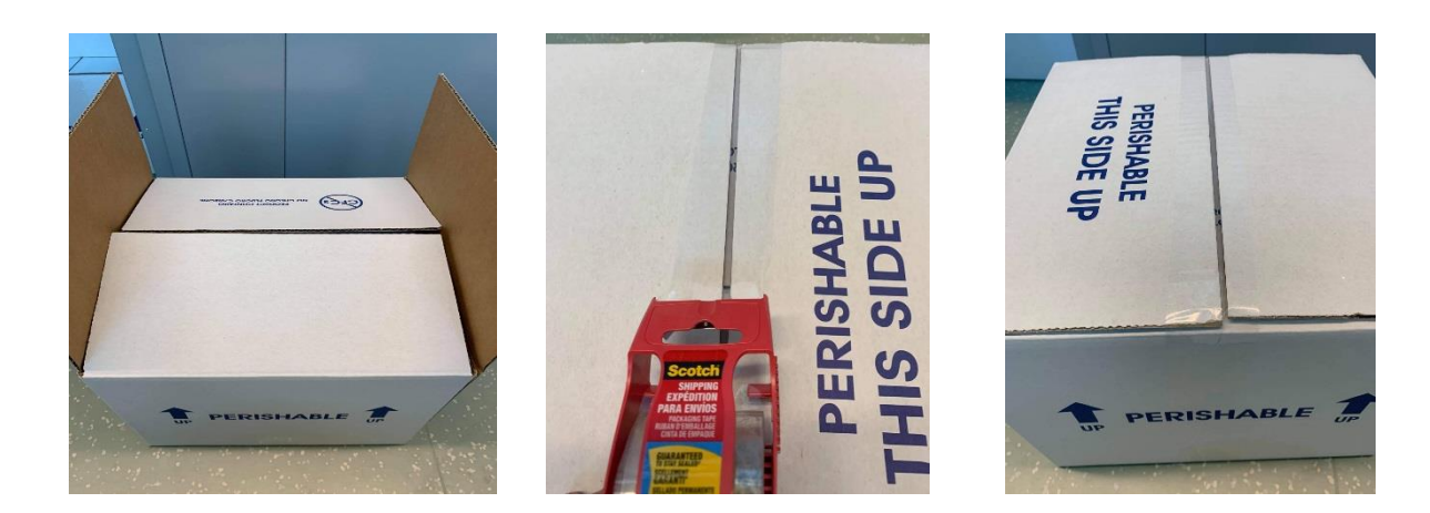
Figure 10- Sealing of sample package