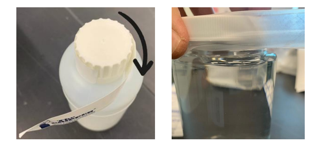
Figure 4 – Example of samples being sealed using bottle cap seal and parafilm

A pre-affixed seal is provided with each bottle. Remove the seal and reaffix at the neck of the bottle in a clockwise direction, i.e. same direction as tightening the cap. If Parafilm is used to seal, place the parafilm so that it cover part of the lid and bottle, then stretch and wrap the lid in a clockwise direction (see Figure 4).