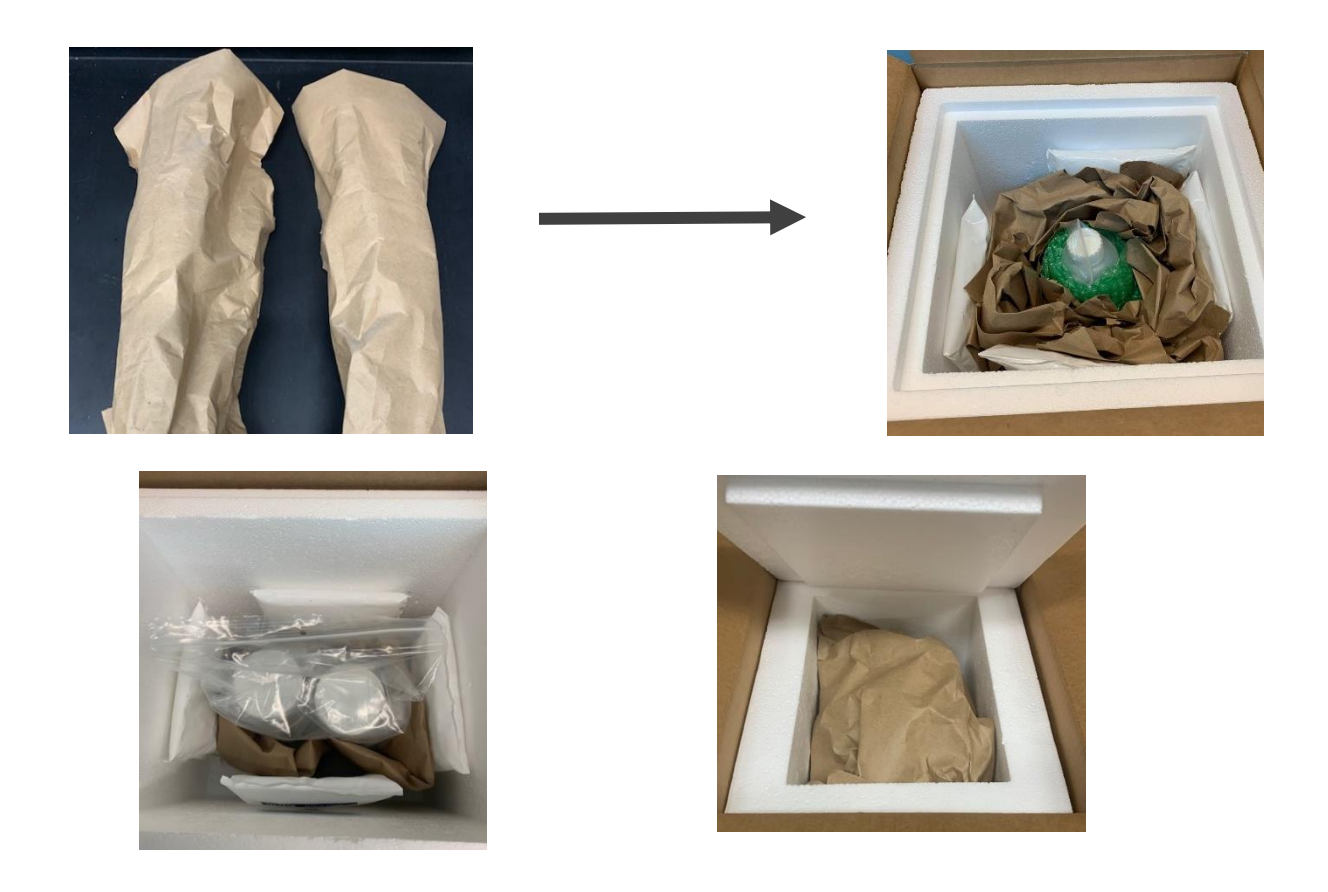
Figure 8 – Examples of brown Kraft paper used for stabilization of sample during transport

Kraft paper may also be used to help stabilize and minimize movement during shipment. (see Figure 8).