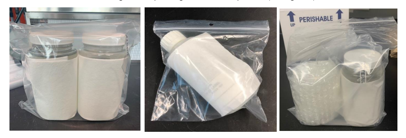
Figure 5 – Examples of samples ready for packing

2. Place the filled bottle into the clear re-sealable leak-proof bag containing the absorbent material. Seal the bag while expressing as much air as possible (see Figure 5).