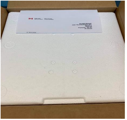
Figure 9- Proper placement of form

requisition form on top of the closed shipping cooler (see Figure 9).