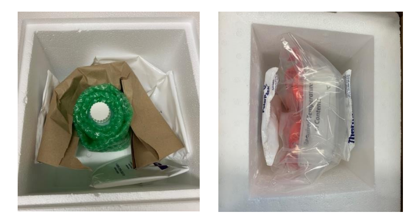
Figure 7 - Sample in cooler

Place the flat frozen cold packs inside the lining of the insulated shipping box with one ice pack on each side. Then place the bubble wrapped bottle, upright, in the middle of the box (as shown in Figure 7).