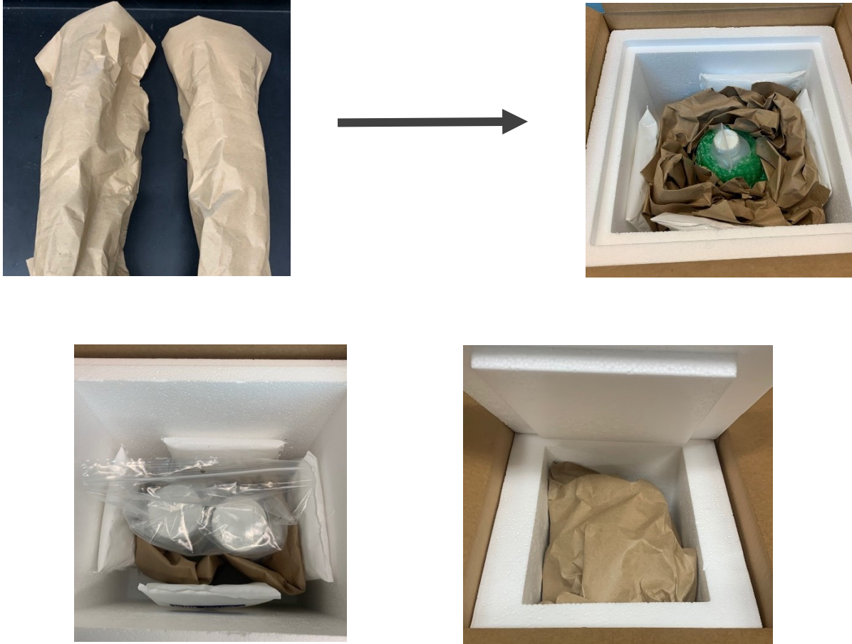
Figure 8 – Examples of brown Kraft paper used for stabilization of sample during transport