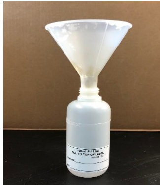
Figure 2 - Bottle filled with the aid of a funnel