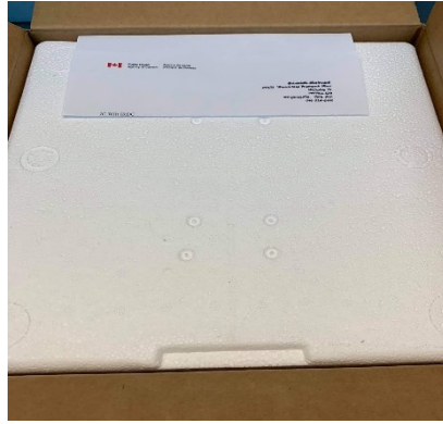
Figure 9- Proper placement of form