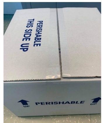
Figure 10- Sealing of sample package