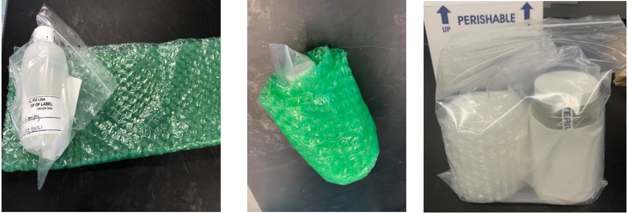
Figure 6 - Bubble wrapping of sample pack