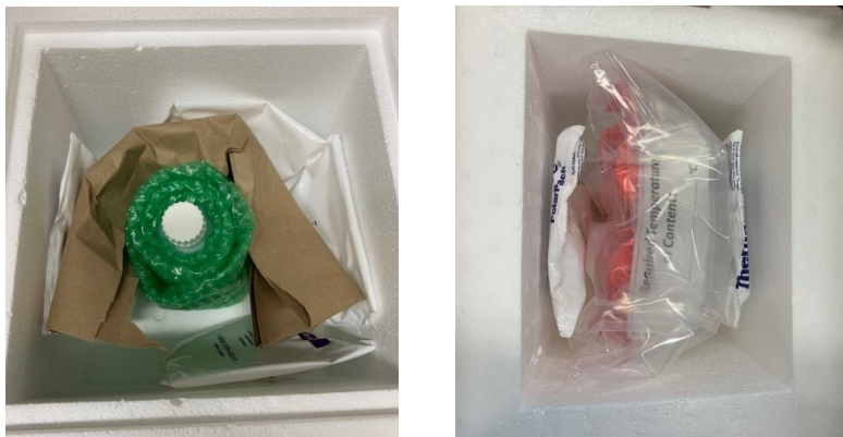
Figure 7 - Sample in cooler