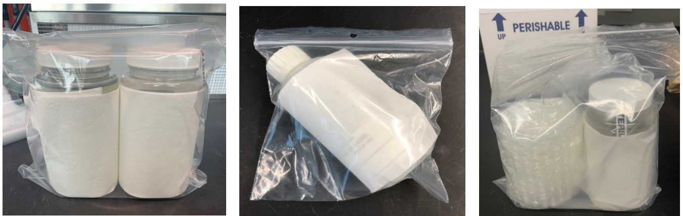
Figure 5 – Examples of samples ready for packing